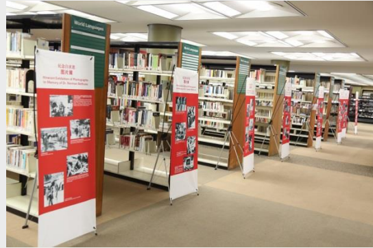
Photo Exhibition on Dr. Norman Bethune at the Edmonton Public Library

Although half day was not long, they all had a good time and appreciated the opportunity to learn about the operation of the CIE.